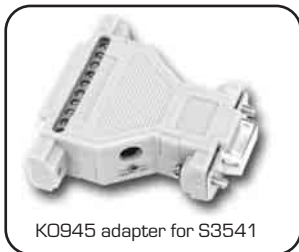
KO945 adapter for S3541