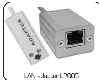
LAN adapter LP005