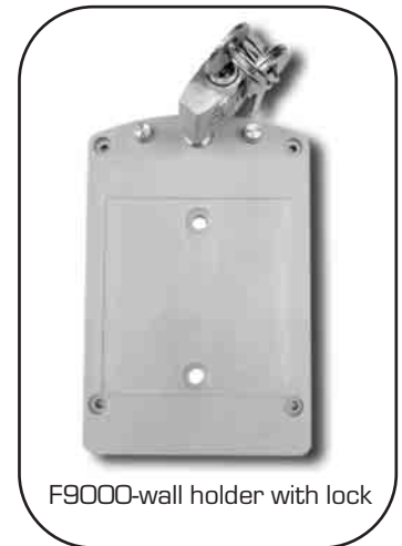
F9000-wall holder with lock