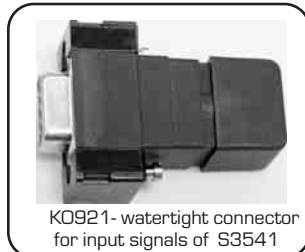
KO921- watertight connector for input signals of S3541